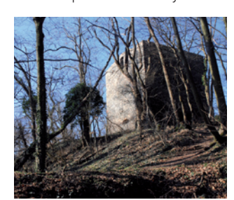
Outer tower with ramparts