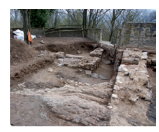
Excavation at the eastern side of the core-castle