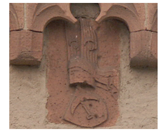
Armorial plate with tracery frieze

The core-castle is surrounded by two wards. The eastern one (7) was supposably erected in the 13th century, the western one (8) in the 14th century. Also, the gate-tower (9) dates from the late 14th century. Its rear was probably already open in the Middle Ages. At its front, there are still traces of the former drawbridge: the deepening for the drawbridge's platform, the apertures for the ropes and the basic stones of their spin axes. Above the entrance, there is an tracery frieze and a nice armorial plate.