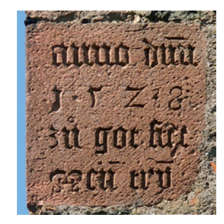
Family's motto at the inner tower