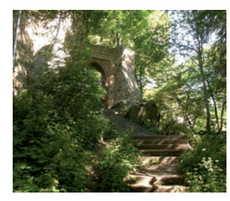
Picturesque small sally gate