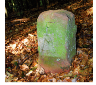
Place of the stone (a)