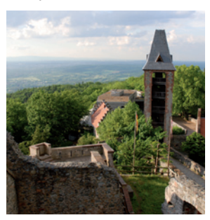
View from the core-castle to the north