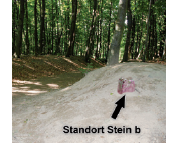
Place of the stone (b)